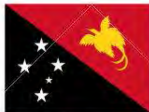
Papua New Guinea