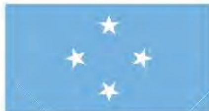
Federated States of Micronesia